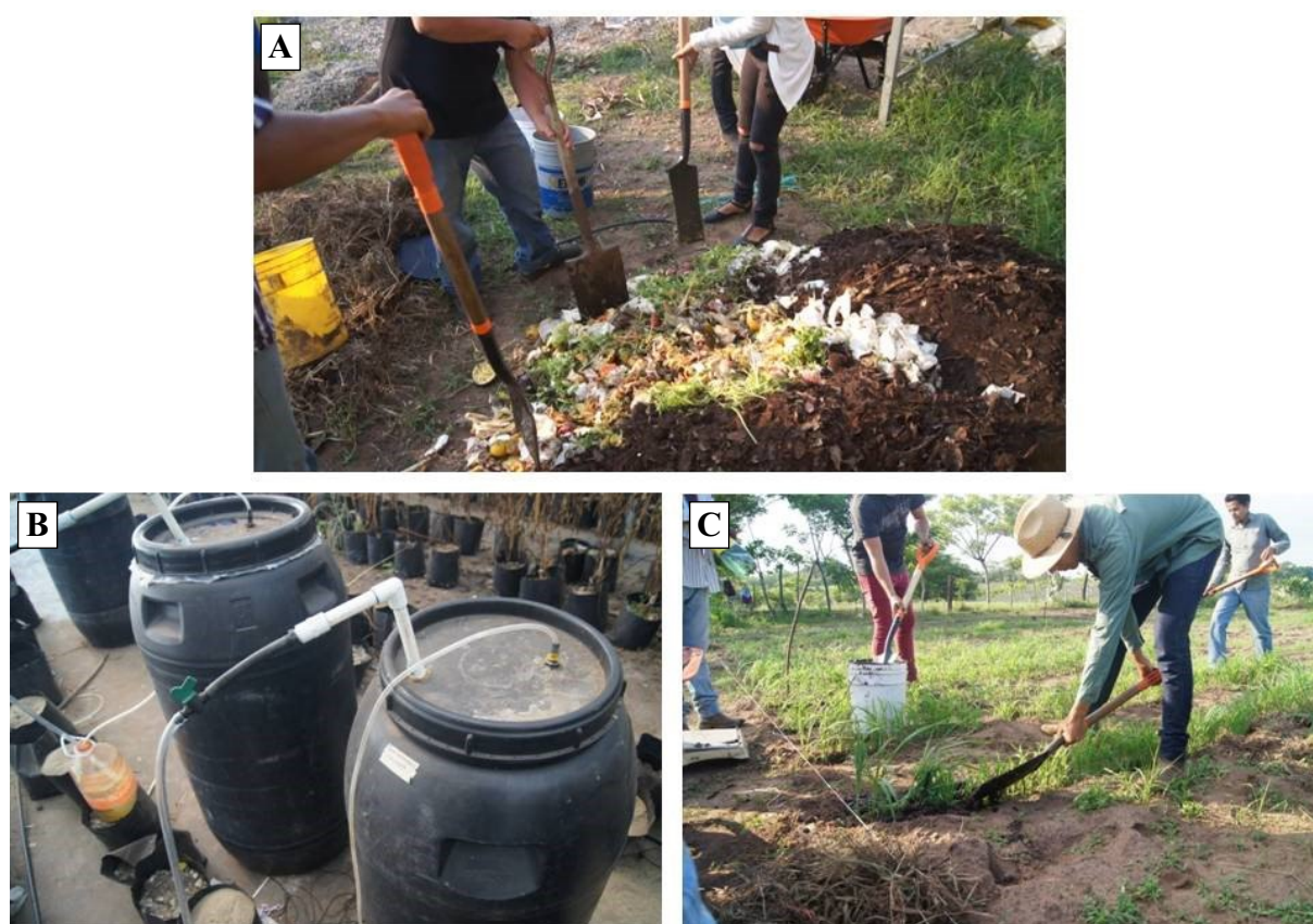
Figure 1. Implemented methodology. A, Vegetable domestic wastes and humus used as substrates in bioreactors. B, Bioreactors for fermentation. C, Application of organic amendments on sorghum plants.